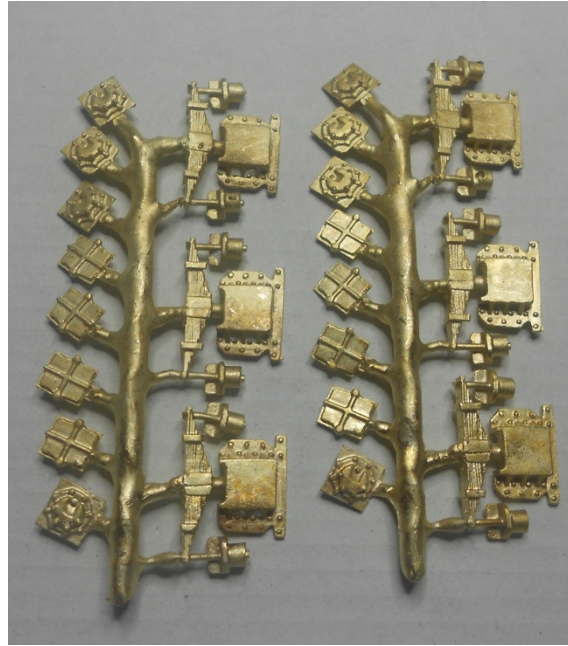
Stanier Tender Axleboxes