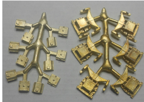
LMS/MR Tender Axle Boxes

Buffers – We are also intending to add to our range of cast, sprung buffers. There are two being developed which are GWR 12" head self contained, and GWR Pre 1929 Oval head, square shanked coach buffers with further ones being planned. Unfortunately these are unlikely to be ready for the current group of shows.