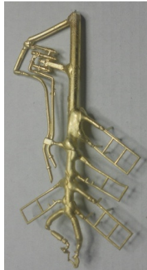
Hornby Bullied Parts